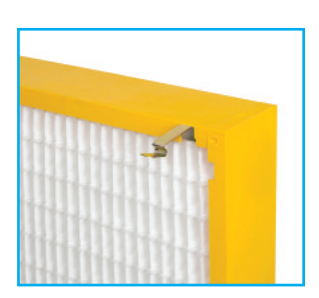
Shown with 2" clip designed to hold an optional pre-filter