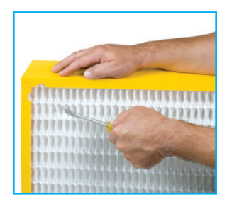
Durable media pack resists damage