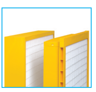
Available in both box style and single header design