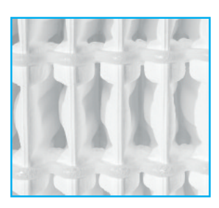
Advanced pleating geometry minimizes resistance to air flow